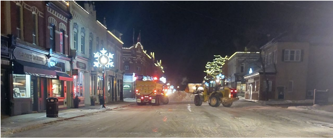
Township Crews Out in the Early Morning Hours to Clear Snowbanks